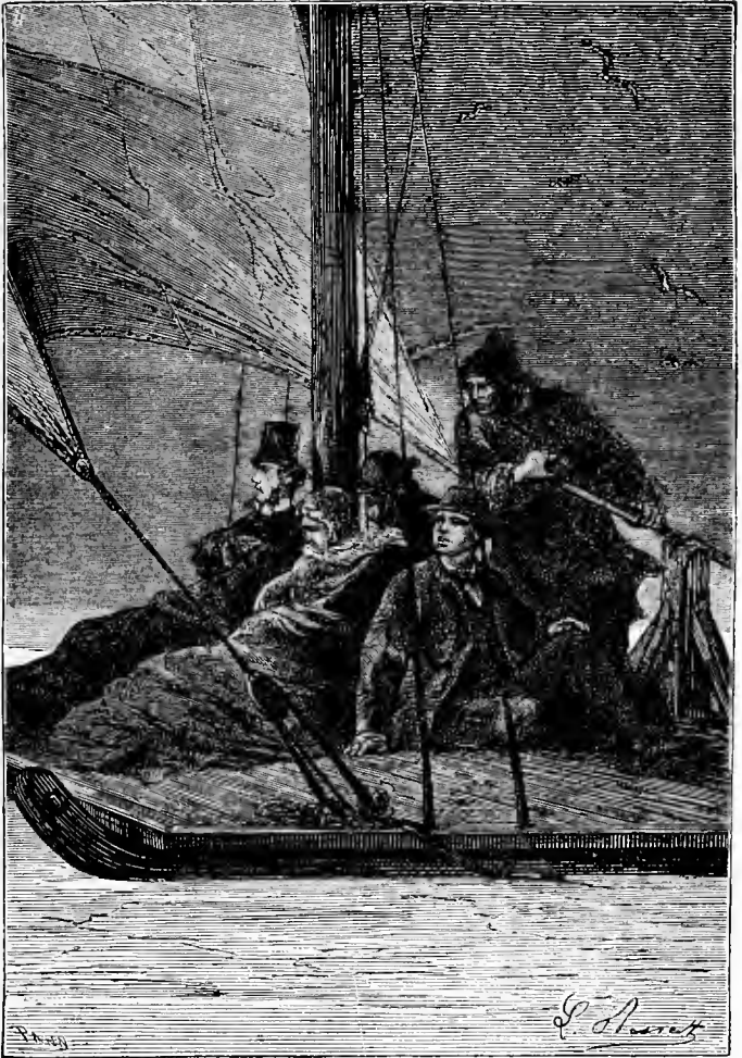
The travellers, pressed against one another . . .